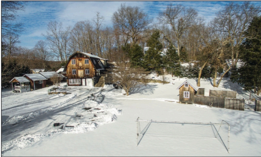
Featuring five bedrooms and an updated chef's kitchen, the home comprises exposed beams and timbers, brick and stone walls, and wide expanses of windows.