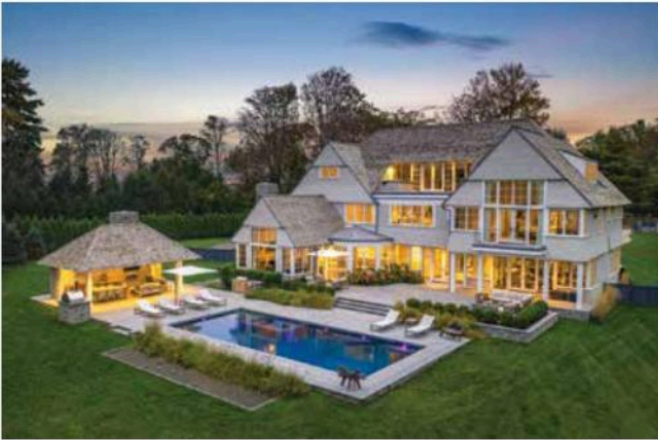
Spa Day, Every Day This Westport property offers a pool, terrace and pavilion, along with a nearly new 9,500-square-foot home. It lists for $11,995,000 with Michelle & Company in Westport. 203-454-4663.