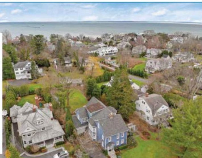
BOTTOM: CT PLANS FOR SOTHEBY'S INTERNATIONAL REALTY