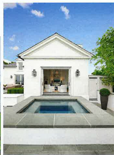
Beauty On The Beach This gracious Southport home is on the market for $16.5 million, offered by Michelle&Company with William Raveis Real Estate in Westport. 203-454-4663.