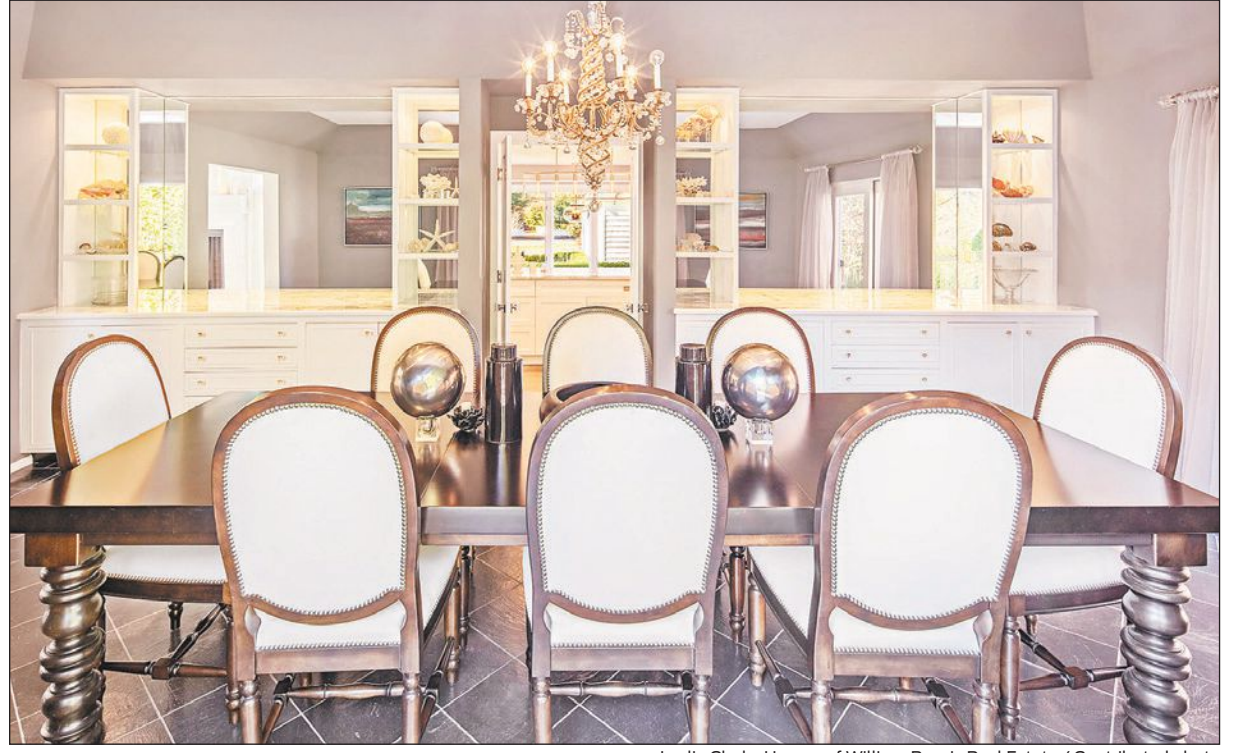
Leslie Clarke Homes of William Raveis Real Estate / Contributed photo

The 5,759 square-foot Contemporary blends a classic storybook exterior with sophisticated, transitional modern interiors and incredible entertaining spaces inside and out. Features of the five-bedroom home include a dramatic twostory living room, new chef's kitchen, media room, recreation room, family room and more, all in a resort-like 1.33 acre-setting. It is offered at $1,599,000 through Michelle and Company of William Raveis Real Estate.