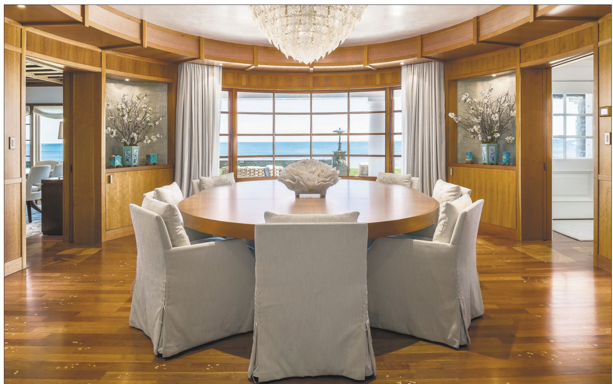
This dining room at 1227 Pequot Ave., Southport, is shaped in a perfect oval.