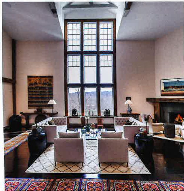
Merryall, a pretty enclave in New Milford, is the site of a sophisticated barn-style home, on 41 acres. One of the owners—who has serious design chops—led the renovation of the interiors, which center on a dramatic great room with a double-height window wall, a salvaged-wood framed fireplace, exposed beams and two staircases that join to create a balcony overlooking the room. Entertainment spaces include a wide, screened-in dining porch and a balcony, overlooking the pond, pool and gardens. It lists for $1,995,000 with Stacey Matthews of the Matthews Group, affiliated with William Raveis.

Next up: Paradise Point, sited on a private peninsula in Westport. Pretty places to gather guests start around the organically shaped swimming pool, constructed of stone and featuring a raised spa with a waterfall edge. The surrounding terraces offer an outdoor kitchen and a pavilion shading a lounge area with a fireplace. Guests will also want to wander down to the 700-foot private shoreline and deep-water dock. Equally appealing: the shingle-style home's indoor living and kitchen spaces, which were built with floor-to-ceiling glass doors and windows with stunning views over Long Island Sound. The nearly 12,000-square-foot interiors also offer a master suite, accessed via a cool catwalk, with cathedral ceilings and a private balcony, along with an additional four bedrooms and six bathrooms, plus an indoor pool. It lists for $12 million with Todd Gibbons of William Pitt Sotheby's International Realty.