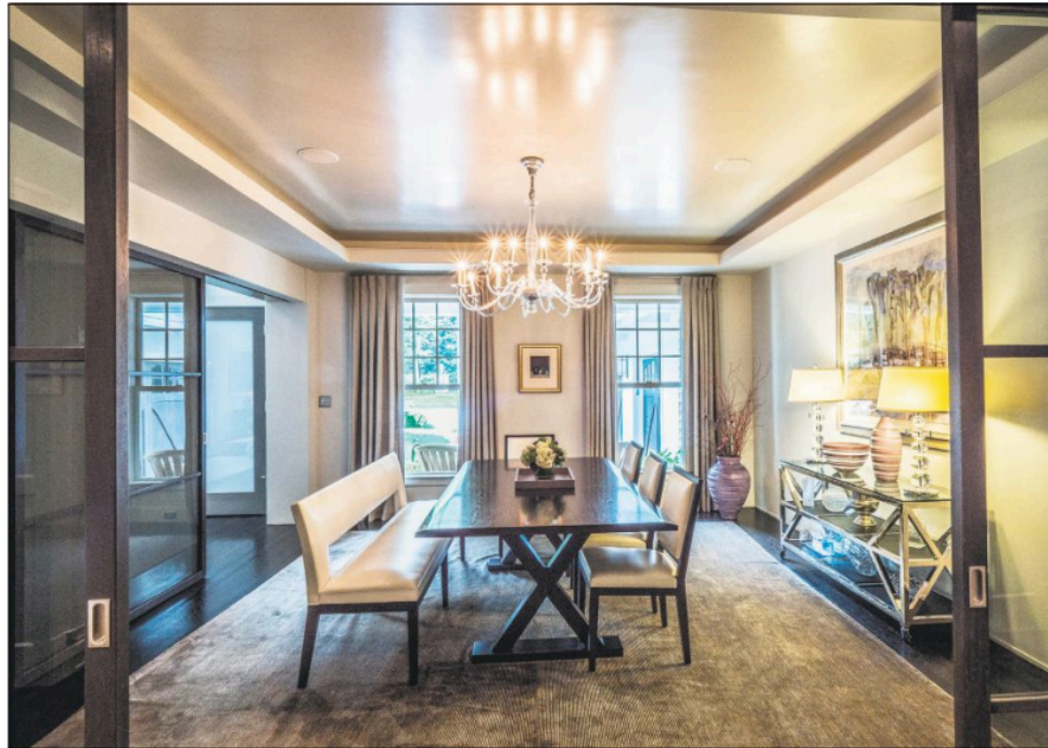
The formal dining room has a tray ceiling and sliding glass doors to separate it from the gallery in the center of the house.

A long row of neatly trimmed hedges borders the front of the property, behind which are several flowering trees. Quarried stone pillars stand at the entrance of the property, both topped with contemporary-styled lanterns. The circular driveway lined in Belgium block concludes in front of the house by the at-