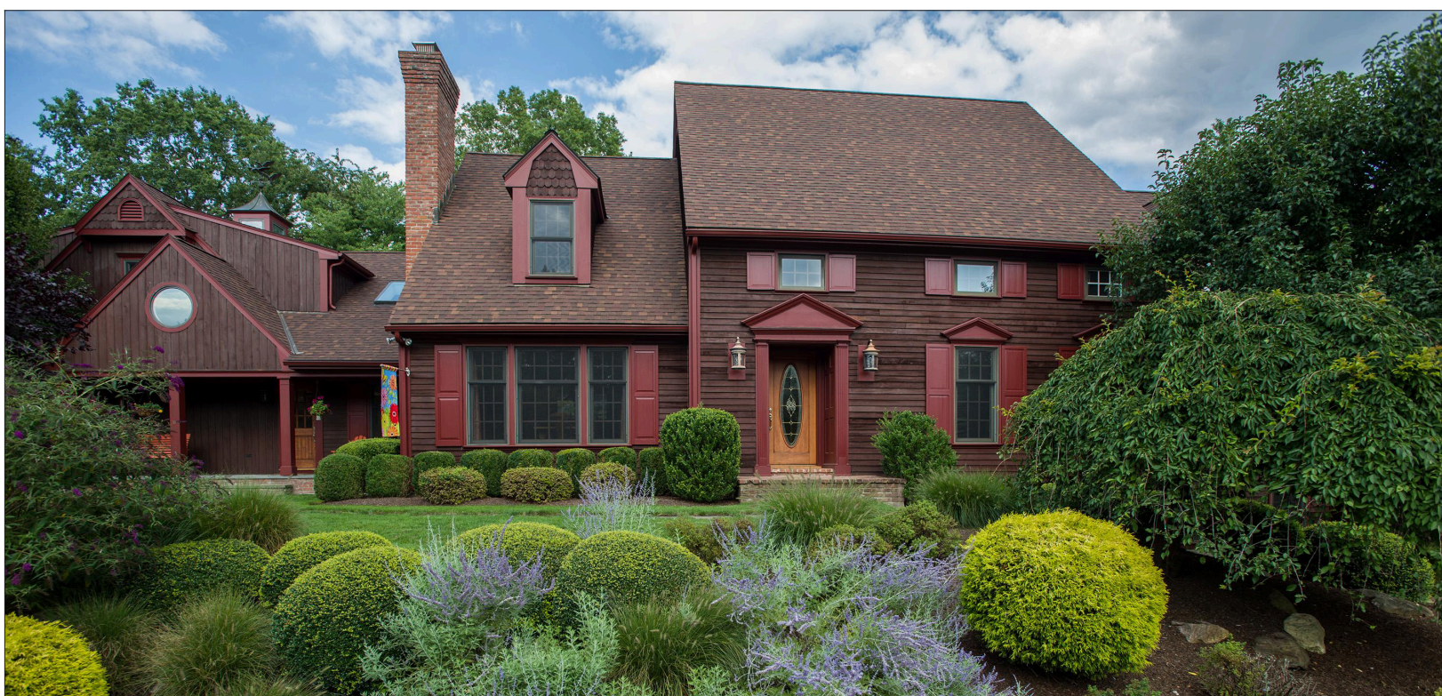
William Pitt Sotheby's International Realty

The first level also boasts the master bedroom suite. The master has dual bathrooms, cathedral ceilings, a walk-in closet, hardwood floors and ceiling fans. In fact, all five bedrooms offer ceiling fans, Smyth said.