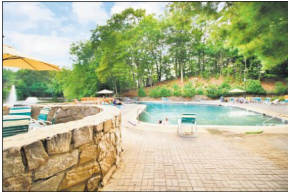
William Pitt Sotheby's International Realty