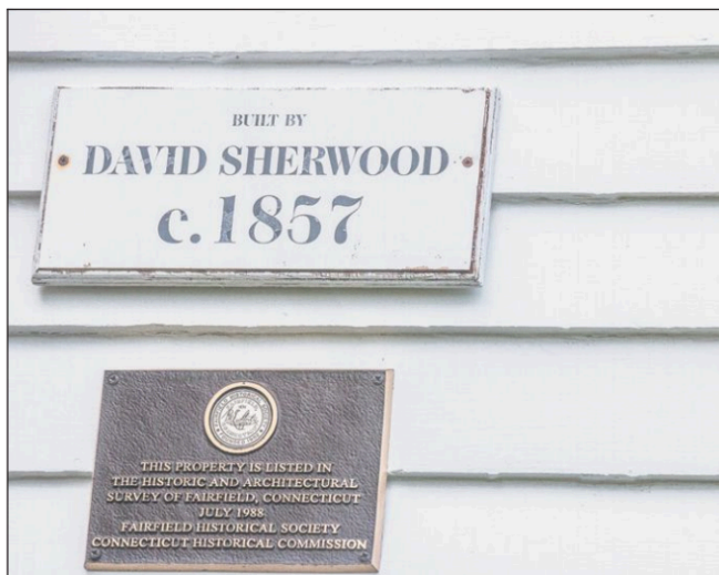
This property is listed in the Historical and Architectural Survey of Fairfield.

This 3,731-square-foot white house with black shutters sits on a 1.24-acre level property. A fieldstone wall sits along the front of the property. The Belgium block-lined driveway leads to the newer detached two-car garage, which has a second floor. At the covered entrance to the house the front door is topped with a rectangular transom that has leaded glass shaped like a fanlight.