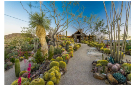
Joshua Tree Mojave Rock Ranch!