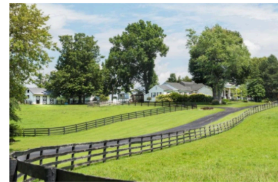
Johnny Depp's Horse Farm Auction!