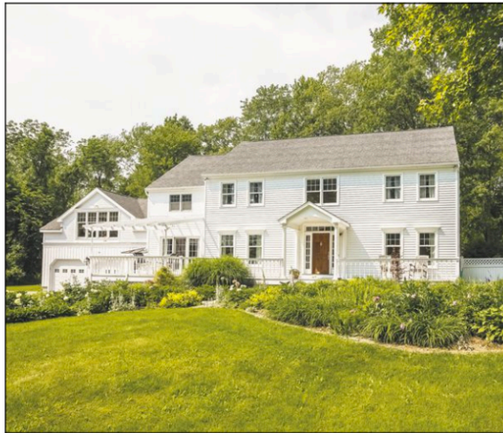
Keller Williams Realty

Details make the difference, and you won't believe the kitchen in this beautiful home. It offers the best of both indoor and outdoor living. Enjoy a recent kitchen and bath remodel along with a cozy gas fireplace, a beverage cooler, built-ins, hardwood floors, crown molding, recessed and pendant lighting, coupled with an elegant design that makes for the look and feel of a model home. The home has economical gas heat, city water, ductless air conditioning and a new tank-less water heater. Enjoy the outdoors in the hot tub or salt-water pool and entertain on the expansive decking while overlooking the level private yard with a