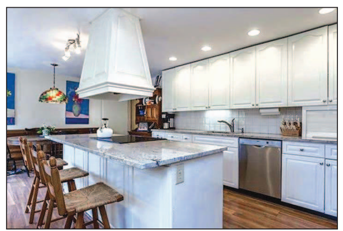
Much of the interior has been renovated and updated, such as the modernized kitchen with granite countertop island.

together a log cabin. This Victorian farmhouse is not that cabin. Nor is its story over. The 3,400-square-foot house,