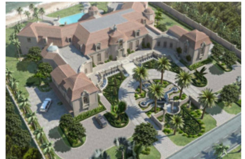
Palm Beach's Most Expensive Mansion!