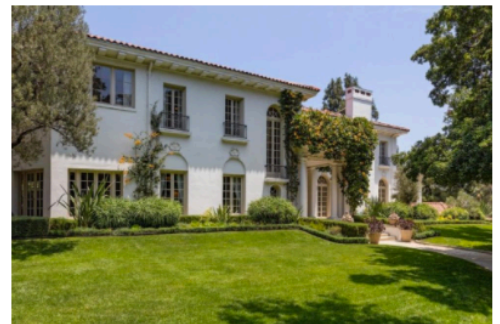
Angelina Buys Cecil B. DeMille Mansion!