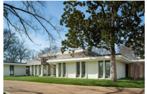
Tammy Wynette's First Lady Acres!