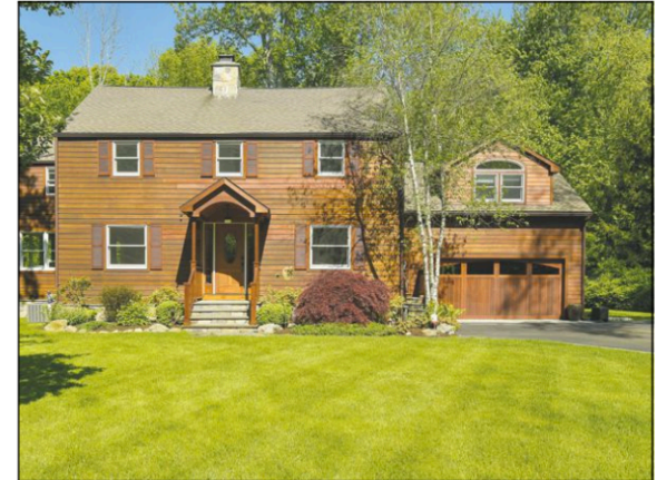
William Pitt Sotheby's International Realty