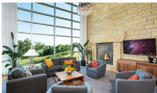
3 ▶ Credit River Township, Minn. This three-bedroom home sits on 10.7 acres along the Credit River. Built in 2003, the house features stone and glass walls, three fireplaces, a workout room, a sauna, and an oversized screened porch. The property is close to area lakes and has multiple terraces, a pool, a spa, and an outdoor kitchen area. $1,495,000. Berg Larsen Group, Coldwell Banker Burnet, (612) 968-6030