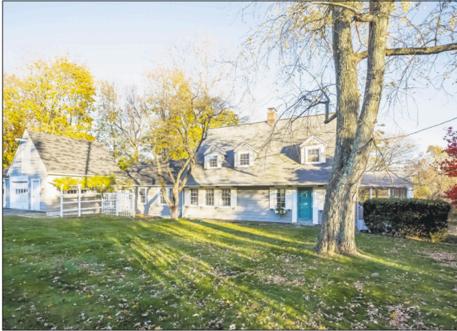
The gray farmhouse with buttercream yellow shutters and white trim at 60 Roseville Road in the Long Lots neighborhood was purchased the day after Christmas in 1946, sight unseen, by famed author and illustrator Hardie Gramatky.

CI | Westport News | Friday, December 16, 2016