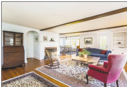
The aqua-colored Dutch front door opens to the good-sized living room, which features exposed beams, red brick fireplace, built-in bookshelves and china cabinet, and a door to a deck that looks over the property.