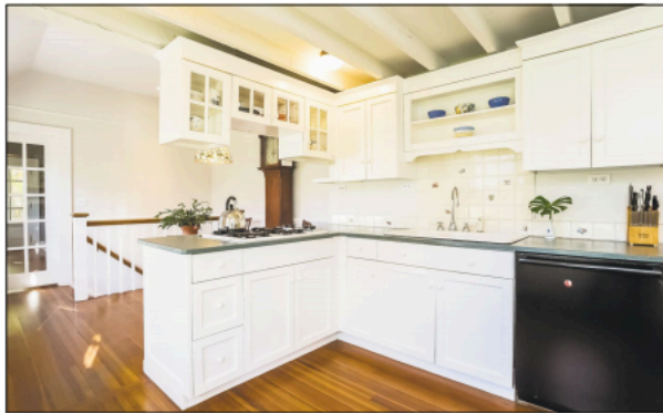
The kitchen features exposed beams painted white, Corian counters and a backsplash of white ceramic tile interspersed with decorative tiles with culinary themes.