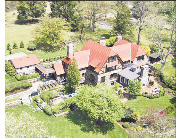
William Pitt Sotheby's International Realty