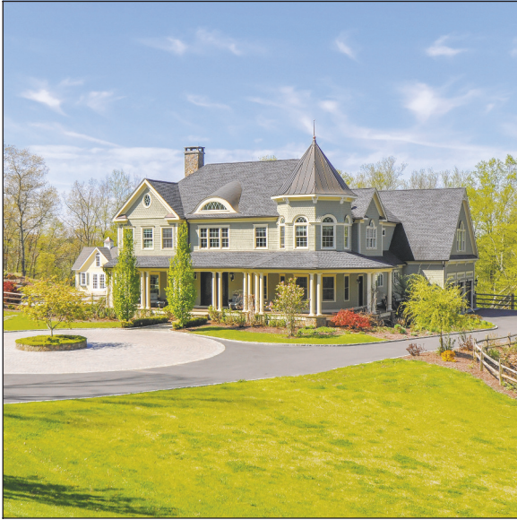
William Pitt Sotheby's International Realty