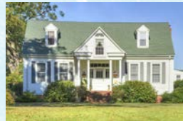
SOUTH CAROLINA, $330,000 Jackson, SC 3,425 square feet 4 beds, 2 baths