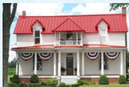
KENTUCKY, $385,000 Wickliffe, KY 2,302 square feet 3 beds, 2 1/2 baths