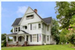
TENNESSEE, $329,900 Newport, TN 3,664 square feet 5 beds, 2 baths