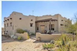
ARIZONA, $284,000 Congress, AZ 1,876 square feet 3 beds, 2 baths