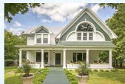
MINNESOTA, $349,000 Taylors Falls, MN 3,332 square feet 5 beds, 2 baths