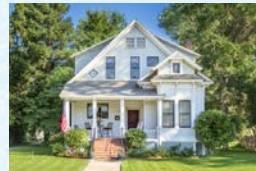
CALIFORNIA, $469,900 Yuba City, CA 3,257 square feet 3 beds, 2 baths