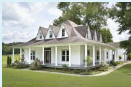
ALABAMA, $140,000 Anderson, AL 3,000 square feet 4 beds, 1 bath

Oh, say can you see a new home in your future? From an Arizona adobe to a Virginia farmhouse, here are our favorite historic houses on the market.