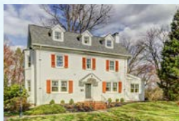
DELAWARE, $399,900 Claymont, DE 2,975 square feet 5 beds, 3 1/2 baths