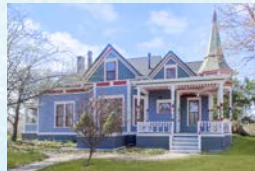
ILLINOIS, $134,900 McLean, IL 3,414 square feet 3 beds, 2 baths