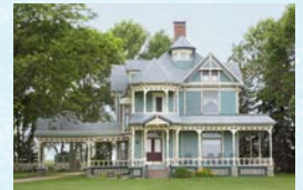
SOUTH DAKOTA, $349,900 Watertown, SD 4,150 square feet 4 beds, 3 baths