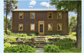
NEW YORK, $295,000 Eagle Bridge, NY 2,320 square feet 3 beds, 2 baths