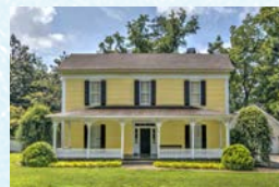
GEORGIA, $395,000 Oxford, GA 3,258 square feet 5 beds, 3 baths