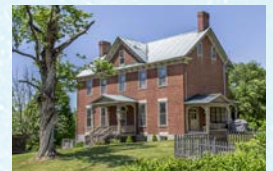
VIRGINIA, $336,000 Abingdon, VA 4,598 square feet 4 beds, 3 baths