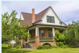
IDAHO, $245,000 Salmon, ID 2,484 square feet 3 beds, 3 baths