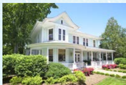
WEST VIRGINIA, $295,000 White Sulphur Springs, WV 3,882 square feet 4 beds, 4 baths