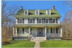
NEW JERSEY, $399,900 Medford, NJ 3,916 square feet 5 beds, 2 baths