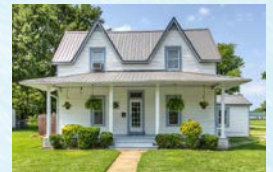
OKLAHOMA, $104,000 Wagoner, OK 1,814 square feet 3 beds, 1 bath