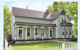
WYOMING, $339,000 Cheyenne, WY 3,610 square feet 4 beds, 3 baths