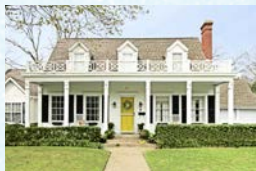
TEXAS, $340,000 Waxahachie, TX 3,002 square feet 4 beds, 2 1/2 baths