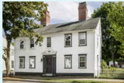
RHODE ISLAND, $350,000 North Kingstown, RI 2,740 square feet 4 beds, 1 bath