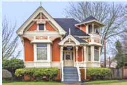
OREGON, $279,000 Albany, OR 4,495 square feet 3 beds, 2 baths