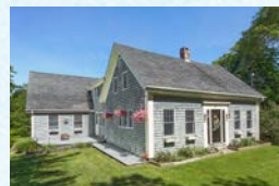
MAINE, $228,500 Boothbay, ME 2,541 square feet 4 beds, 2 baths