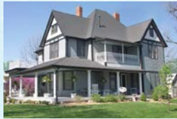
MISSOURI, $174,900 Corder, MO 3,028 square feet 3 beds, 3 1/2 baths