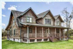
LOUISIANA, $345,000 Schriever, LA 3,693 square feet 4 beds, 3 1/2 baths