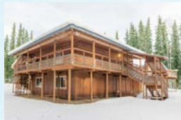
ALASKA, $325,000 North Pole, AK 2,400 square feet 3 beds, 2 baths