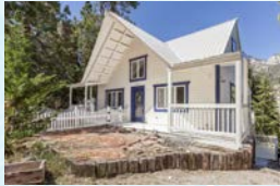
NEVADA, $499,900 Mount Charleston, NV 2,931 square feet 3 beds, 2 1/2 baths