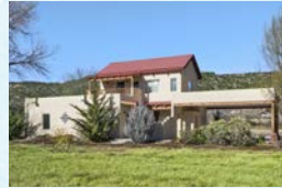
NEW MEXICO, $235,000 Velarde, NM 1,525 square feet 2 beds, 2 baths