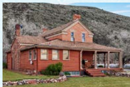
UTAH, $275,000 Toquerville, UT 1,485 square feet 3 beds, 2 baths