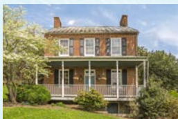
MARYLAND, $376,225 Myersville, MD 2,720 square feet 4 beds, 3 baths