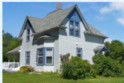
NORTH DAKOTA, $185,000 Fingal, ND 1,850 square feet 5 beds, 1 bath