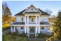
INDIANA, $371,500 Jasper, IN 5,292 square feet 6 beds, 4 baths