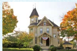
WISCONSIN, $249,000 Portage, WI 3,022 square feet 4 beds, 3 baths