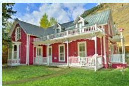
COLORADO, $399,000 Georgetown, CO 2,012 square feet 6 beds, 6 baths