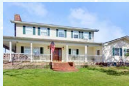
ARKANSAS, $375,000 Royal, AR 2,764 square feet 4 beds, 3 baths