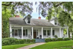
FLORIDA, $394,000 Quincy, FL 4,200 square feet 3 beds, 1 1/2 baths