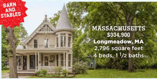
MASSACHUSETTS, $334,900 Longmeadow, MA 2,796 square feet 4 beds, 1 1/2 baths