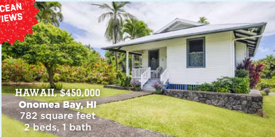
HAWAII, $450,000 Onomea Bay, HI 782 square feet 2 beds, 1 bath