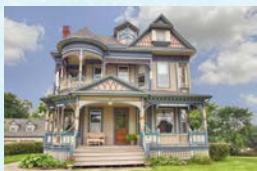
IOWA, $280,000 Osceola, IA 2,424 square feet 4 beds, 4 baths