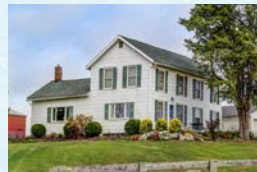
OHIO, $364,900 Ostrander, OH 2,008 square feet 3 beds, 2 baths