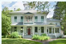
MICHIGAN, $369,900 Chesaning, MI 3,729 square feet 4 beds, 4 baths