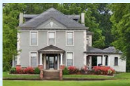
KANSAS, $399,950 Leavenworth, KS 3,725 square feet 5 beds, 2 1/2 baths