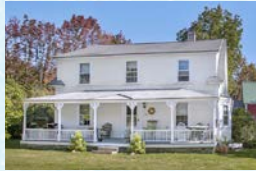
NEW HAMPSHIRE, $237,500 Lyndeborough, NH 2,081 square feet 3 beds, 2 baths