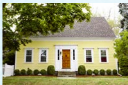
CONNECTICUT, $349,000 Clinton, CT 2,419 square feet 3 beds, 2 baths