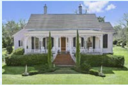
MISSISSIPPI, $398,000 Moss Point, MS 3,200 square feet 3 beds, 2 baths