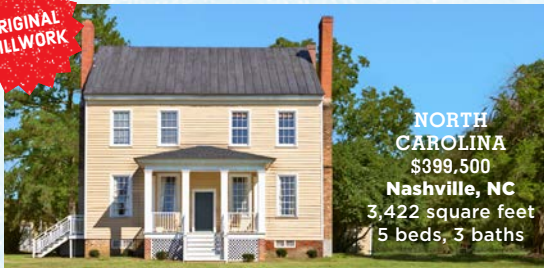
NORTH CAROLINA $399,500 Nashville, NC 3,422 square feet 5 beds, 3 baths