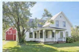
VERMONT, $189,000 Mount Tabor, VT 2,436 square feet 4 beds, 2 1/2 baths