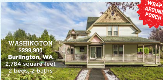
WASHINGTON $299,900 Burlington, WA 2,784 square feet 2 beds, 2 baths