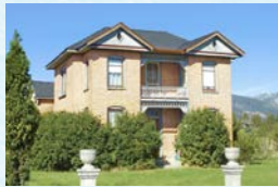
MONTANA, $300,000 Hamilton, MT 1,932 square feet 3 beds, 2 baths