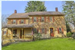
PENNSYLVANIA, $289,900 Reading, PA 2,896 square feet 4 beds, 3 baths