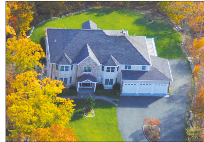
Keller Williams Luxury Homes

This exquisite high-end home is strategically located on two acres with privacy near area amenities. It has 7,000 square feet of meticulously designed space with attention to every detail while a four floor elevator provides easy access to each level. The magnificent two-story foyer boasts an elegant, sweeping stairway with balcony overlooking marble floors. The grand, two-story great room, with balcony opens out to the expansive patio area and private landscaped backyard. Enjoy the sophistication of the elegant dining room or the tranquil setting of the breakfast room. The chic kitchen is designed with open spaces and ample counter space, plus a multilevel attached island, a wet bar a huge preparation room. The two-story master suite includes two decks.