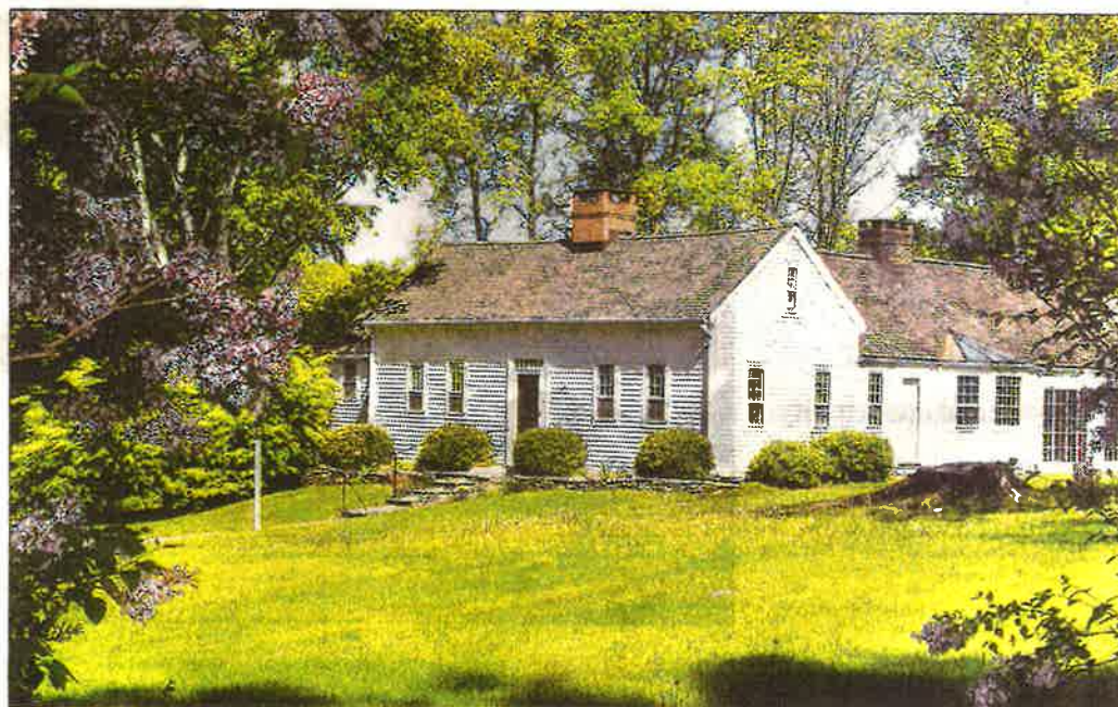
The Darius Gray House was built circa 1776, and is one of the oldest homes in Sharon.

When getting down to the precise details, the history of the Darius Gray House in Sharon is a little spotty. But that's only when getting down to the precise details. If you're painting with a broad brush, seeing the home as a collection of stories and memories, not just hinges and floorboards, the history of the Darius Gray House is bold and colorful. The sturdy eight-room farmhouse, an antique structure tucked away deep in the country, is one that has seen, over multiple generations, the many changes of rural New England. And in all that time, it has stayed well out of sight, surrounded by Hamlin Pond and thousands of woodland acres of Jackson Peck land. When it comes to determining its age, the picture is again uncertain, but the home is probably as old as the United States of America.