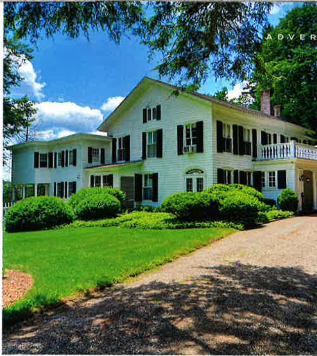
ABOVE LEFT: Silverbrook, a gentleman's horse farm at 2728 Route 44 in Millbrook, N.Y., encompasses more than 50 acres.