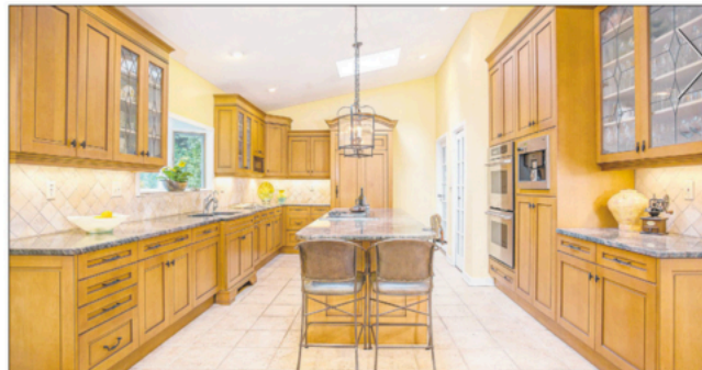
Skylights brighten the kitchen, which features high-end appliances.