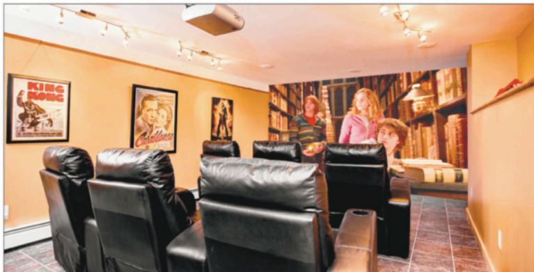
The home theater.