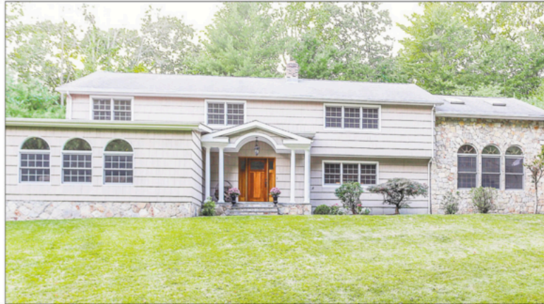
The property at 4570 Black Rock Turnpike is on the market for $1,249,000.

RI | Fairfield Citizen | Friday, November 6, 2015