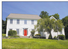
William Pitt Sothby's International Realty

This King Street neighborhood colonial sits on 1.66 serene acres that start when one enters between stone pillars and up the private driveway with circular ending point. Inside, the two-story foyer opens to a sophisticated column sitting area with custom wine bar. The elegant living room and formal dining room are also off the foyer. Beyond that, a sun-flooded, eat-in kitchen features granite countertops, a large center island, pantry and stainless steel appliances. A slider opens onto a stone patio. A private office, laundry room, family room with vaulted ceiling and stone fireplace, and half bath finish off the first level. The second floor consists of the bedrooms, including a master suite with vaulted ceiling, walk-in closets, a shoe closet, whirlpool bathtub and a separate toilet room. It includes a large carpeted family and game room with additional room for guests or perfect as a pair accommodation. It is served by Danbury High School, while the elementary and middle schools are per the board of education.