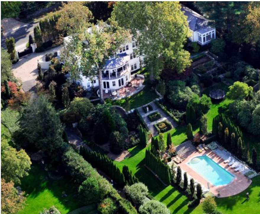
The estate at 402 Sasco Hill Road is on the market for $7,995,000. The 7,165-square-foot house has views of Southport Harbor from many of its 14 rooms.