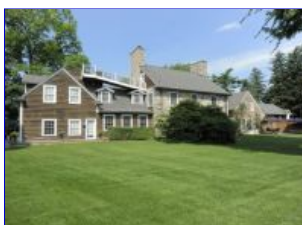
165 Davenport Stamford