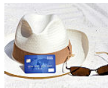
Ingenious Way To Earn A Free Flight Lending Tree