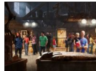
Barnum Museum: Building a 21st century museum from scratch