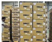
Do Not Buy A Computer With Windows 10..Until You've Read This... Comments for Tech News