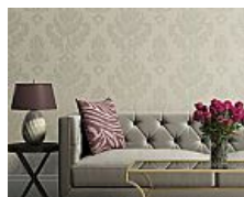
The Online Furniture