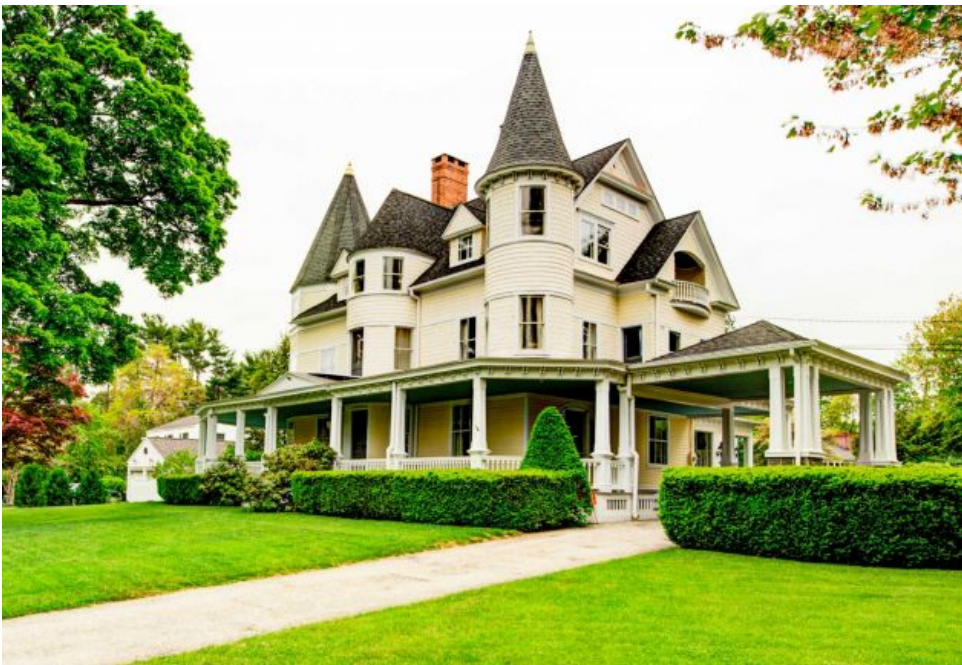
The property at 220 Farist Road is on the market for $899,999.