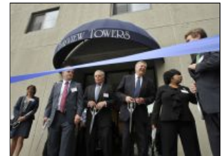
CHFA revises loan qualifications