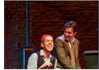
Musical mystery 'Murder for Two' at Long Wharf

Popular Website Reveals More Than Major... Instant Checkmate