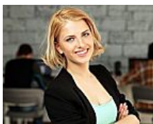
Why This App is Quickly