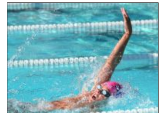
Rocky Point Club captures fourth consecutive FCSL title; Roxbury the runner-up