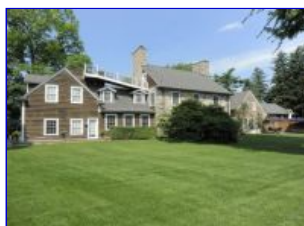
165 Davenport Stamford