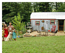
How a Family of 4 Lives