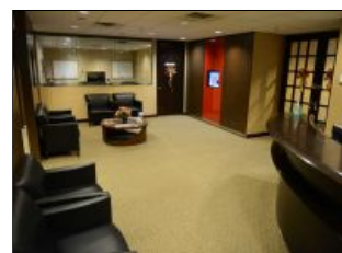
Stark Office Suites makes Inc. 5000 list