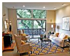
6 Things Your Home