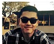
Here's How a 23-Year