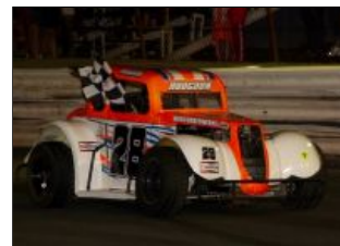
Danbury's Hodgdon captures LegendStock race