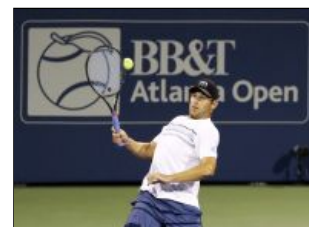
Roddick living life, loving retirement