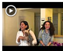
Tiny Takeover: Watch