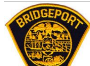
Cops: First a warning, then shots fired