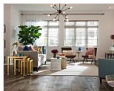
Biggest Home Design