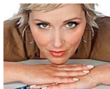
Transferring your credit