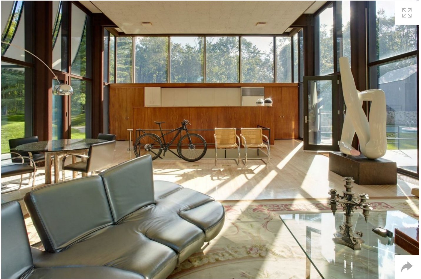
William Pitt Sotheby's