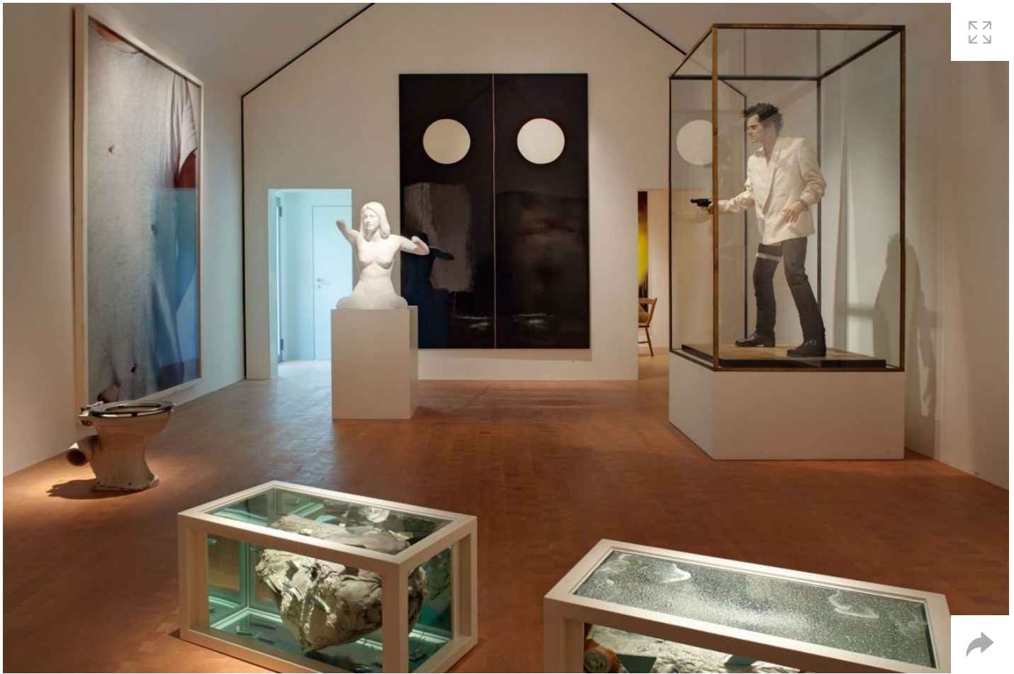
William Pitt Sotheby's