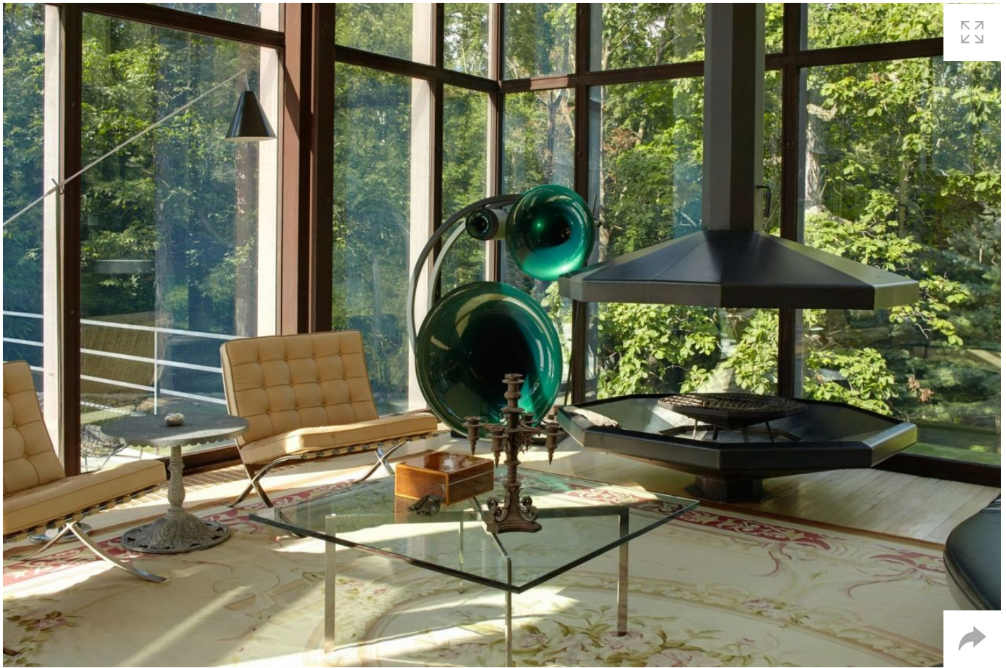
William Pitt Sotheby's