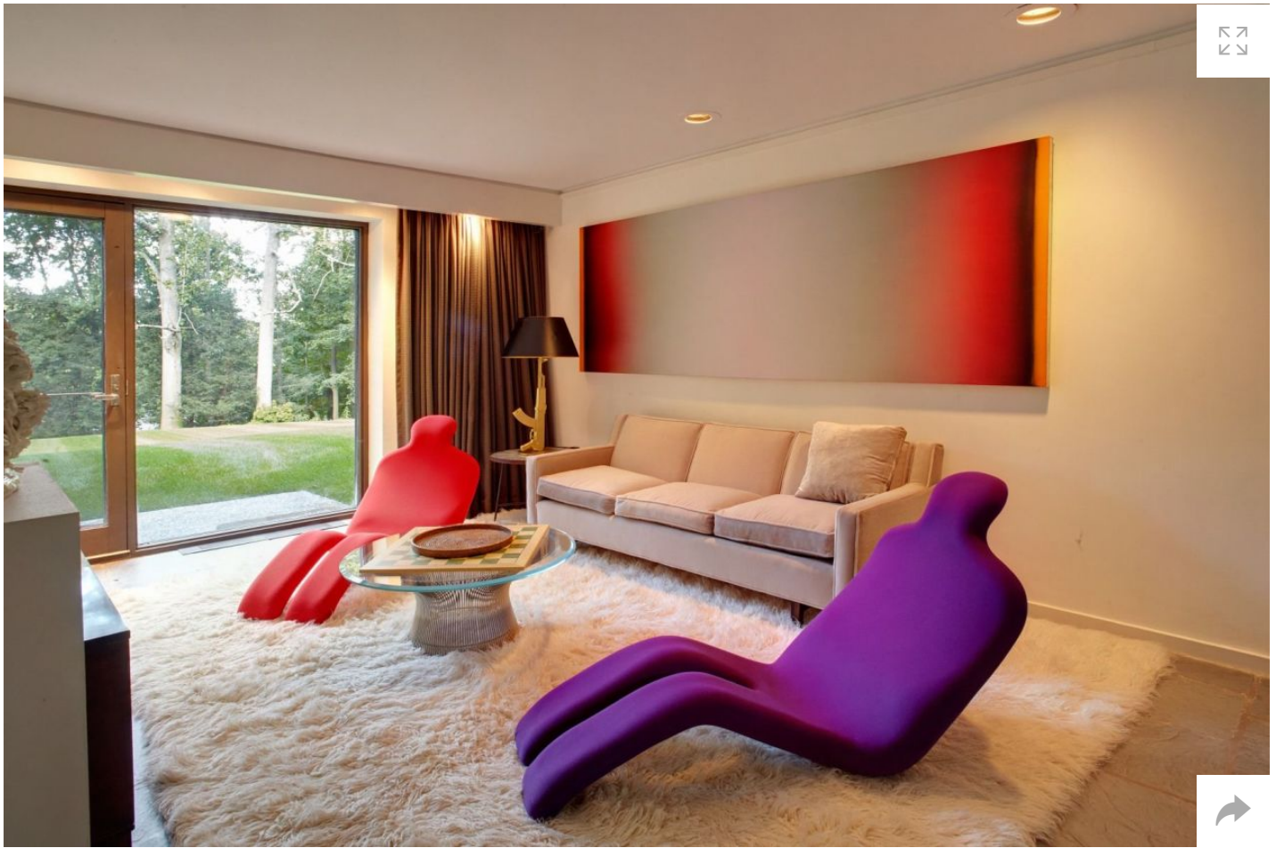
William Pitt Sotheby's