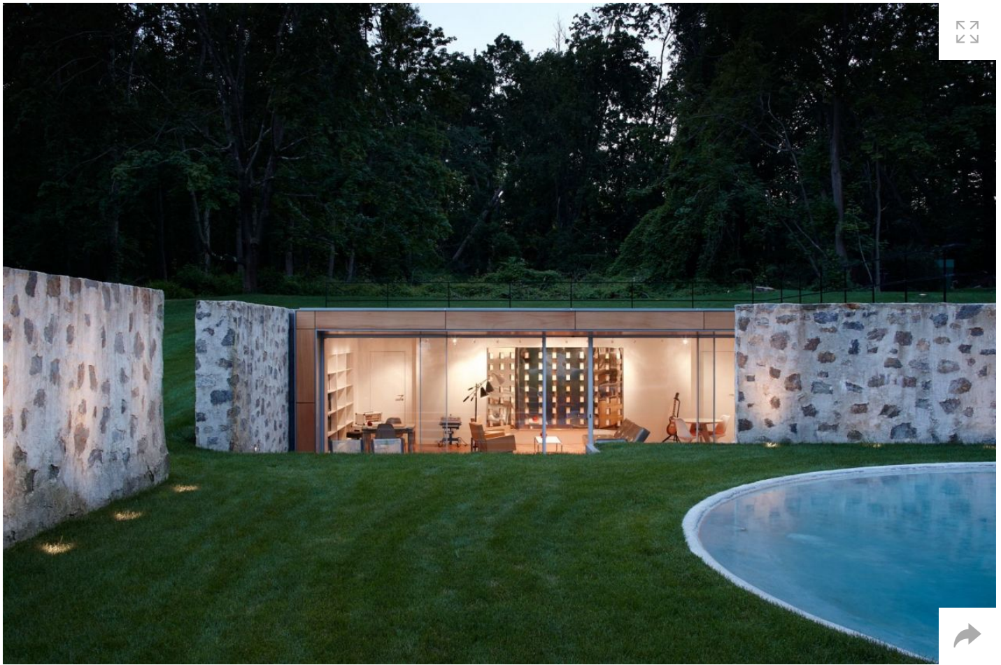
William Pitt Sotheby's