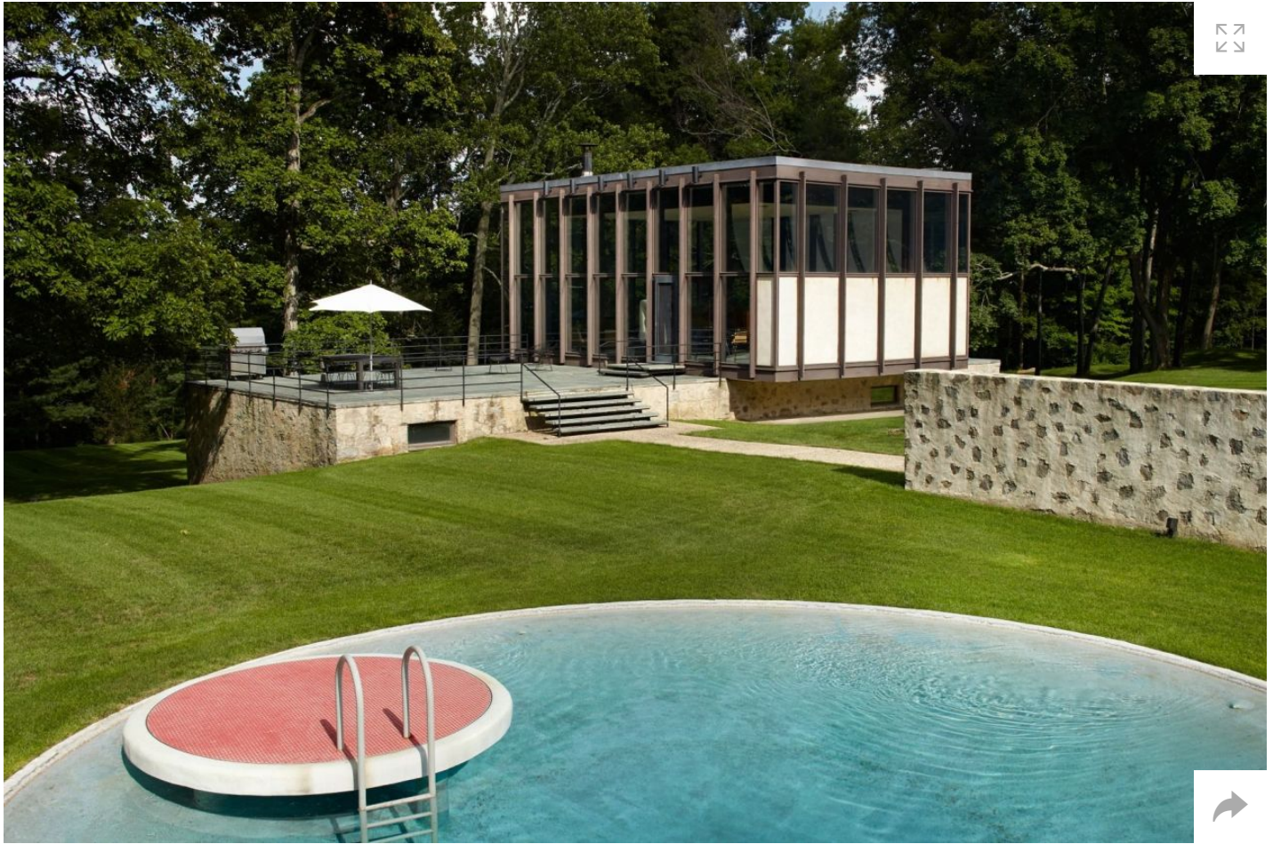
William Pitt Sotheby's