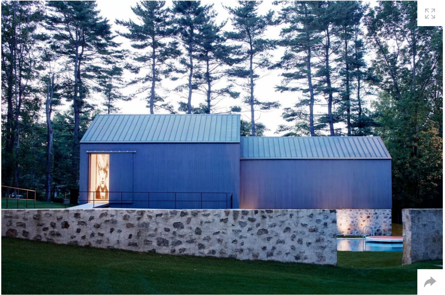
William Pitt Sotheby's