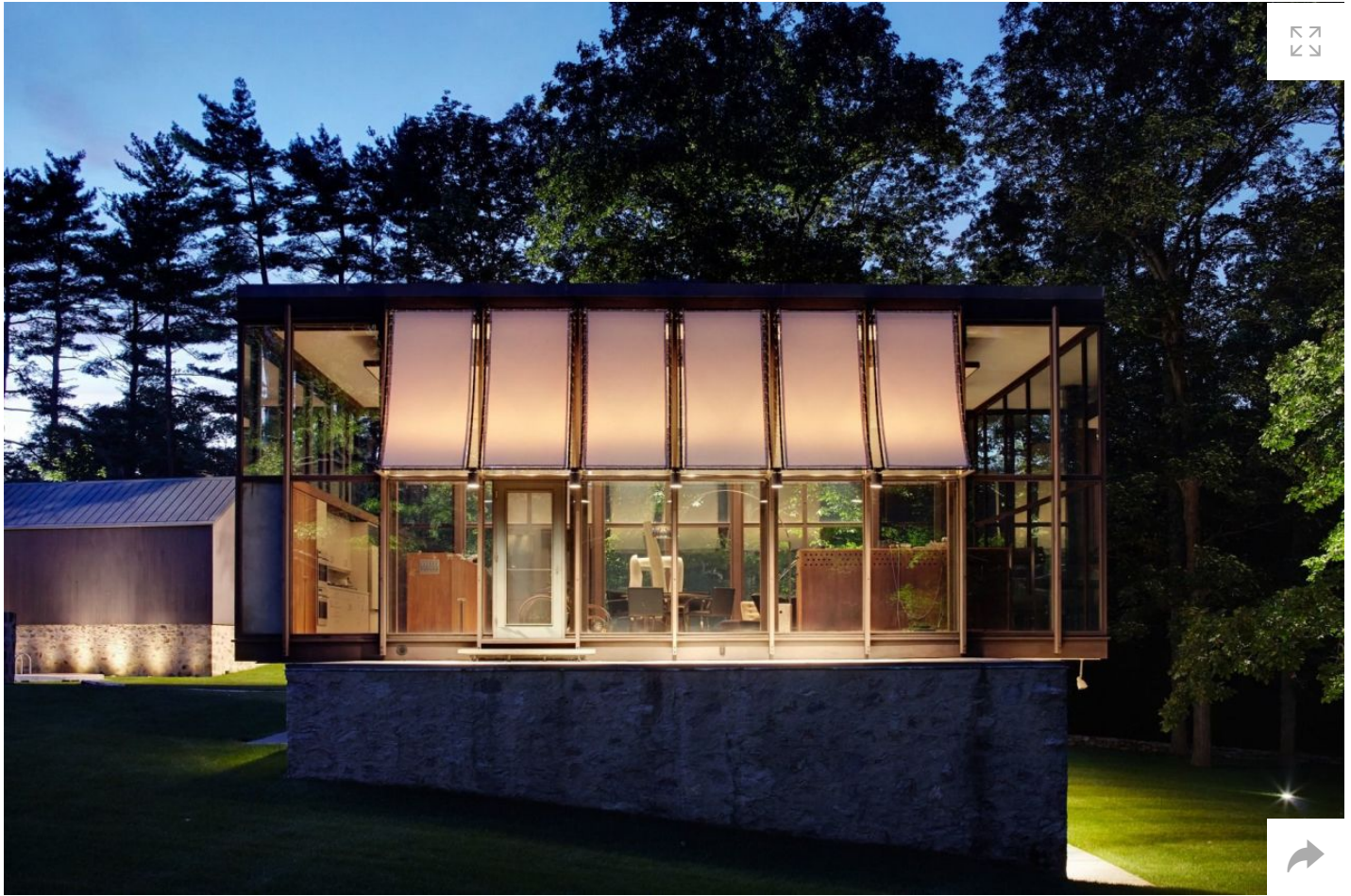
William Pitt Sotheby's