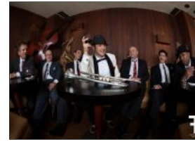
Stamford Culture Cache