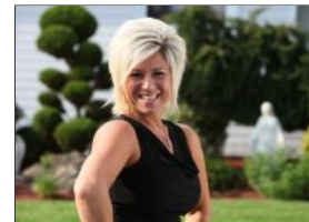
Reality TV star does interactive Uncasville show