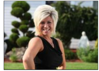
Reality TV star does interactive Uncasville show