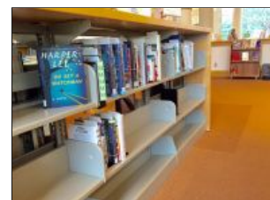
Library reservations top 200 for Harper Lee's new book