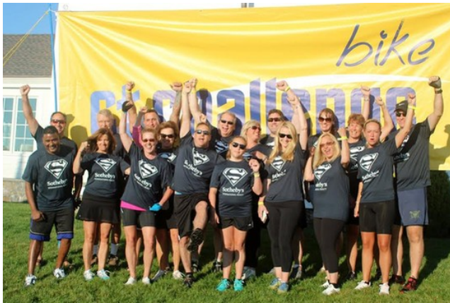
Team Sotheby's shows its excitement about riding in the CT Challenge.