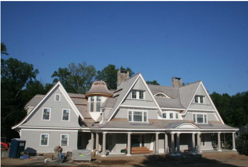
The exterior of 114 Skyview Lane