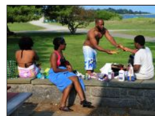
Sales tax on parking fees goes into effect