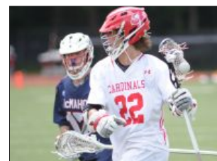
Hearst Connecticut Media Boys Lacrosse All-Stars