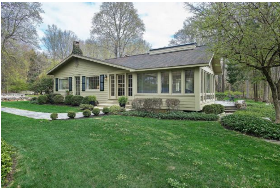
This 200 Mill Road home in New Canaan sits on a private peninsula of five homes, accessed by driving over a wooden bridge and through the woods.