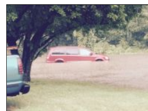
Almost month’s worth of rain hit Danbury in one day