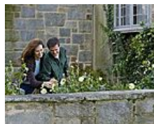
Escape to Connecticut: a Downtown Abbey Getaway for 2 Awaits CT Tourism