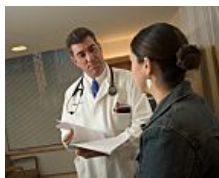
5 Stomach Cancer Facts to Know Dana-Farber/Brigham and Women’s Cancer Center