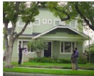
Before Making an Offer on a House, Read This Realtor.com