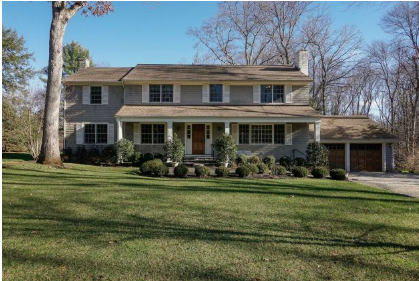
In mid-May, a Sotheby's International Realty-listed house at 295 Woodbine Rd. in North Stamford sold for $990,000, amid a broader pickup of activity in the Fairfield County residential real estate market.