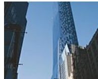
Extell's big tax break on One57 revealed Crain's New York Business