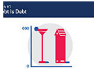
11 Credit Myths: Don't Fall for 'Em Experian