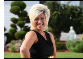
Reality TV star does interactive Uncasville show