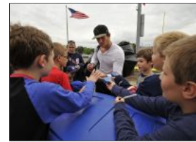
NHL stars come out and shine at Big Assist VII