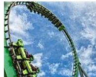
Is it Possible to Take Your Dream Vacation While Paying Off Debt? Student Loan Hero