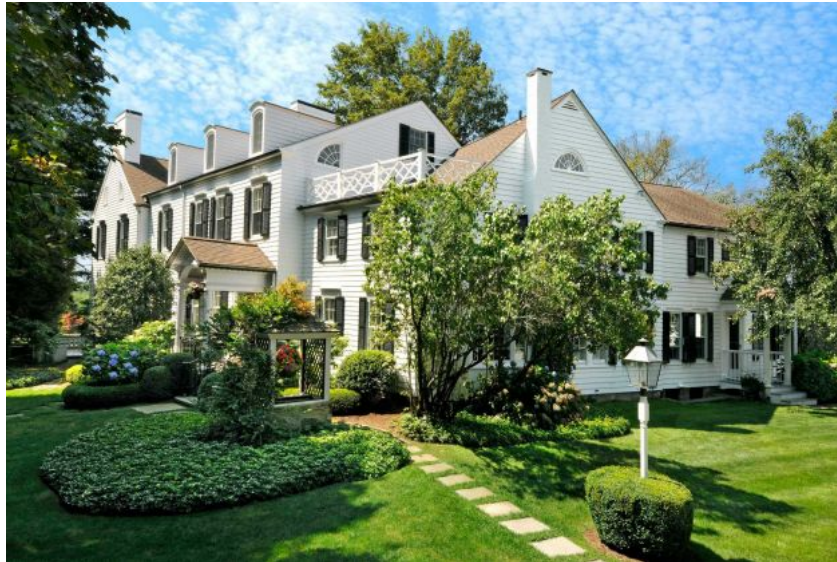
A Taconic Road estate in Greenwich, Conn. was among nearly 300 homes sold in the town there in the first half of 2015, with listing agent Sotheby's International Realty noting an increase in market volume throughout the region between April and June. Photo: Hearst Connecticut Media Buy this photo