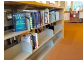
Library reservations top 200 for Harper Lee's new book