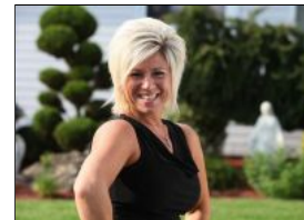
Reality TV star does interactive Uncasville show