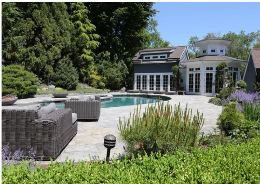
A separate pool house with an octagonal dining room was added in 2001.

The house is listed for $5 million with Wendy Alper of Julia B. Fee Sotheby's International Realty.