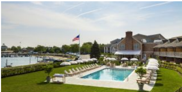
BARON'S COVE IS BACK: INSIDE THE SAG HARBOR RESORT...