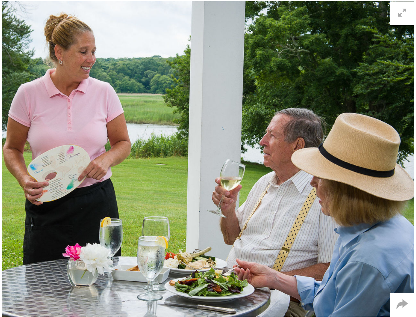
CAFÉ FLO IS ON THE BANKS OF THE CONNECTICUT RIVER.

6. The main thoroughfares in in all these towns are the epitome of quaint New England charm.