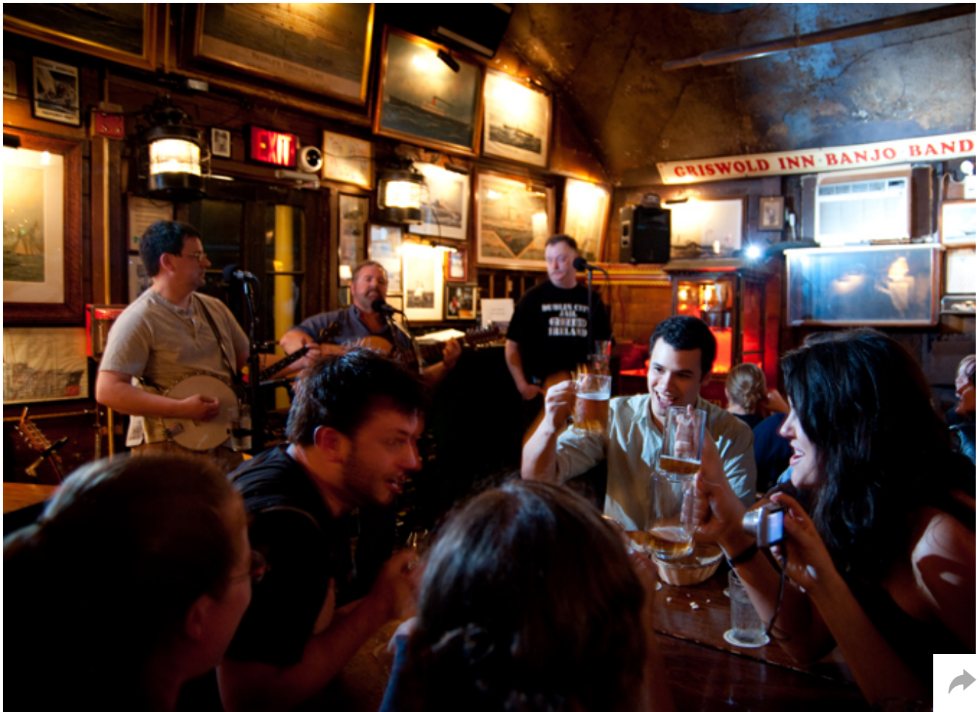
THE TAP ROOM FEATURES SEA SHANTIES EVERY MONDAY NIGHT.