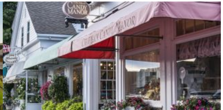
T&C BEST OF: CHATHAM, CAPE COD

4. Although these towns are on the Long Island Sound, many of the beaches are just as picturesque as the Atlantic Ocean's (and much less crowded!).