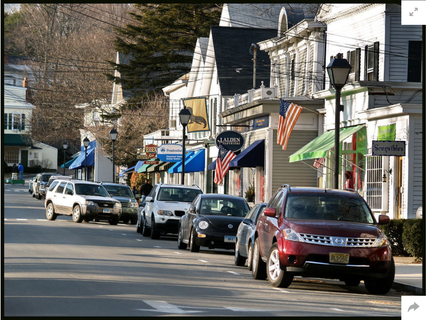
ESSEX'S MAIN STREET.