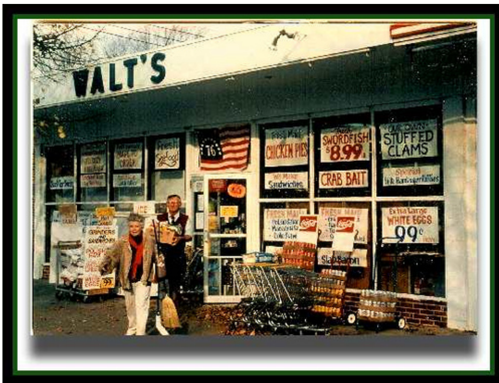
KATHERINE HEPBURN AT WALT'S, AN OLD SAYBROOK MARKET ON MAIN STREET.