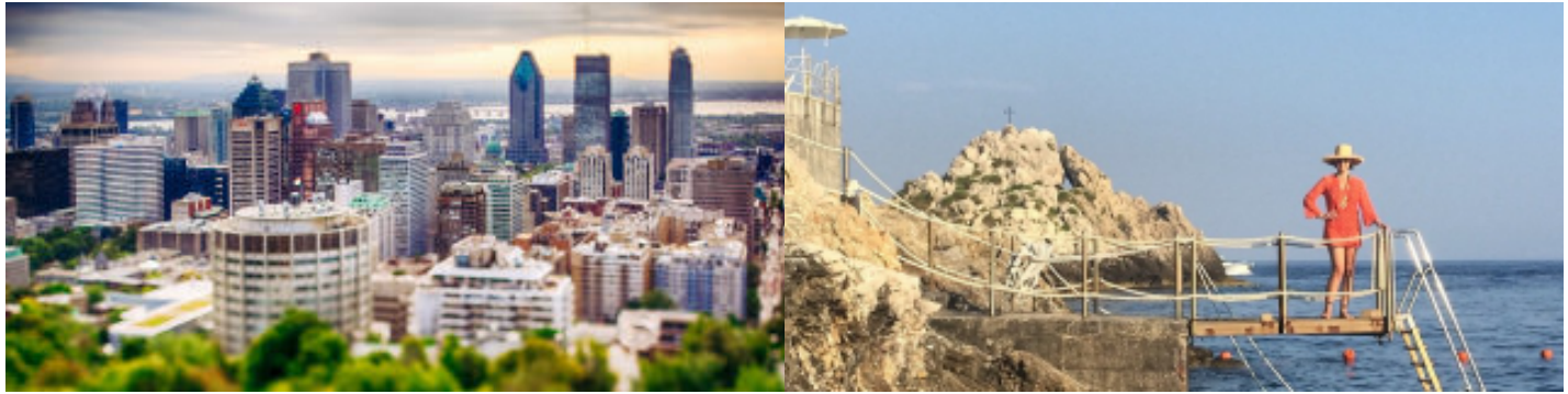
T&C TRAVEL GUIDE: MONTREAL