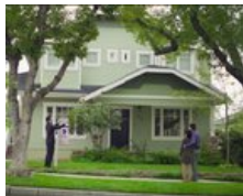
Before Making an Offer on a House, Read This Realtor.com