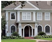
Ready to move in? Extra costs you need to consider Fox Business