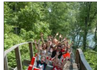
Season for amusement parks gets under way in Conn.