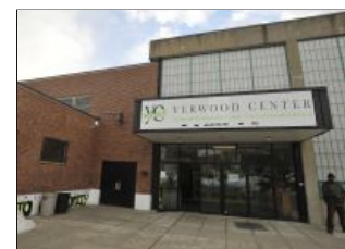
Yerwood Center board hosts community meeting