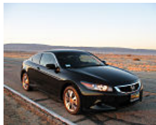
Save Money in 2015 by Refinancing Your Car Loan in Dallas GoBankingRates.com