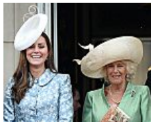
Kate's Back! The Best Photos from Trooping the Colour People