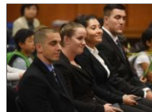
Debate rages over best number