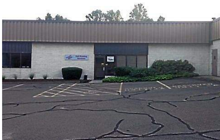
1484 Highland Ave., Cheshire

Posted: 06/13/15, 4:38 PM EDT | Updated: 1 day ago