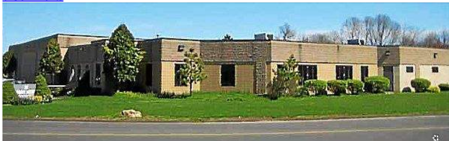
16 Business Park Drive, Branford