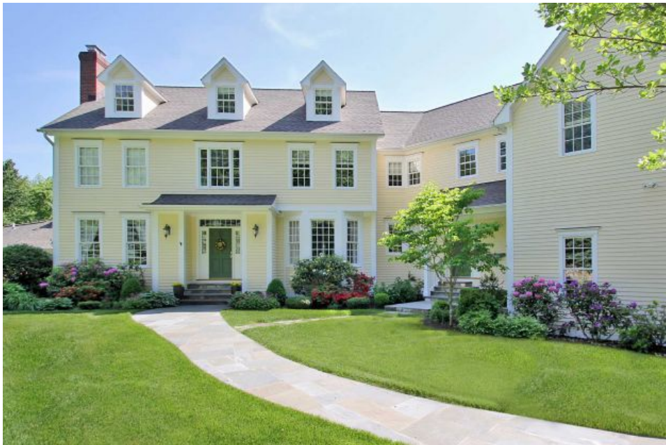
The property 3791 Congress St. is on the market for $2,295,000.