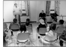
From The Stamford Advocate archives: 1990