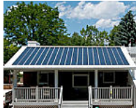
Homeowners are Paying Next to Nothing for Solar Panels Solar America