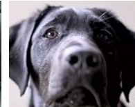
Meet the Cutest Dog Who Has a Big Job Ahead Zipcar