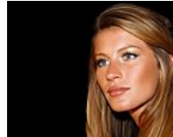
20 Hottest Sports Wives And Girlfriends Your Daily Dish