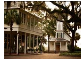
Visit Once, Stay Forever