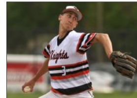
Stamford Senior Legion team well stocked with arms