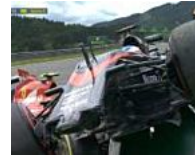
Fernando Alonso and Kimi Räikkönen involved in scary first-lap... MSN