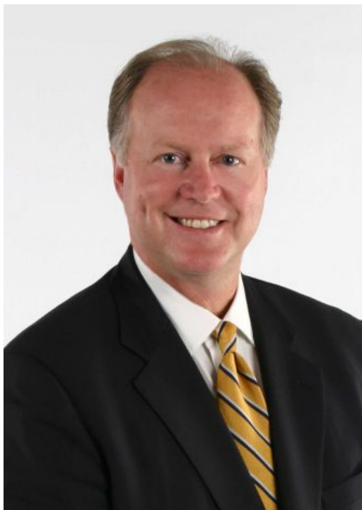
Bruce Baker