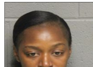
Cops: Health aide took money from couple