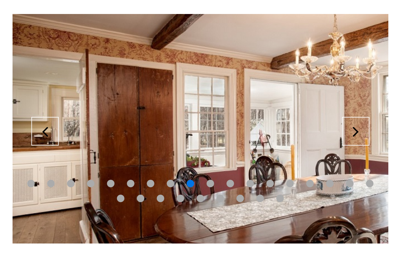
✓ UNIQUE HOMES (HTTP://WWW.ZILLOW.COM/BLOG/CATEGORY/UNIQUE-HOMES/) / ✓ GALLERY / BY MELISSA ALLISON (HTTP://WWW.ZILLOW.COM/BLOG/AUTHOR/MELISSAALLISON/) ON 29 JUN 2015

The sunroom and master bath have radiant heat, and the kitchen boasts a Sub-Zero refrigerator.