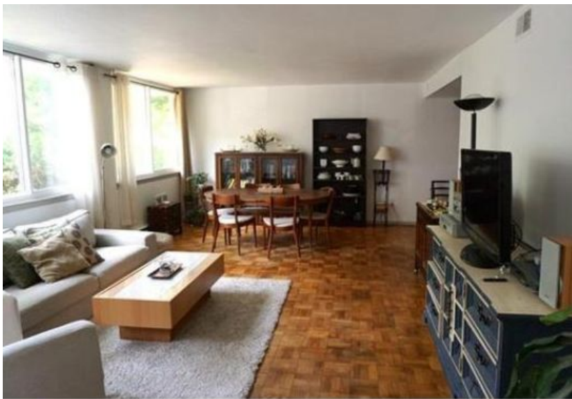
This spacious condo on Colony Drive has three bedrooms, two bathrooms, and one powder room.