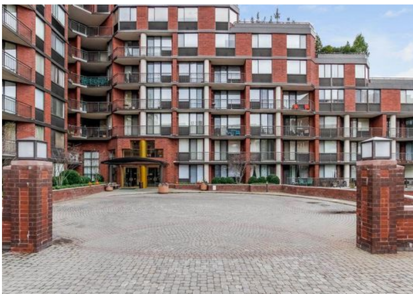
This penthouse offers access to an indoor swimming pool, hot tub, gym, sauna, underground parking, 24-hour concierge service and a 725-square-foot private rooftop garden terrace.

Listing Agent: Christopher Pagli at William Raveis Legends Realty, Tarrytown, 914-406-9023, christopher_pagli@yahoo.com.